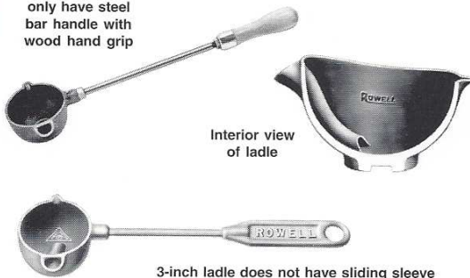
Interior view of ladle

Sizes 1 and 2 only have steel bar handle with wood hand grip