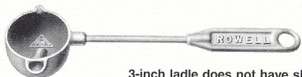
3-inch ladle does not have sliding sleeve